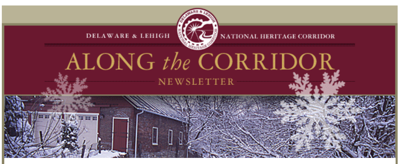
Winter 2014/2015 - Connect - Preserve - Revitalize - Celebrate