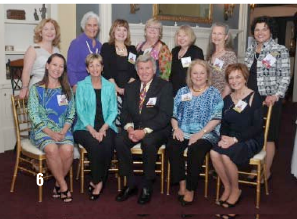
Spring Dinner & Auction Committee

The mule-drawn Josiah White II canal boat hosted thousands of passengers on weekly rides in 2015. But it was perhaps most popular as a floating eatery and stage for Saturday evening themed dinner cruises that were part of the D&L's annual "Conversations on the Canal." Seven cruises took place between late June and early October, featuring history, music and great food prepared by Culinary Experts of Allentown. While historic themes — Irish and Italian immigration, canal life, the Lenape people of the Lehigh and Delaware valleys — dominated the lineup, additional beer and wine tasting cruises and a 1950's sock hop attracted even more guests.